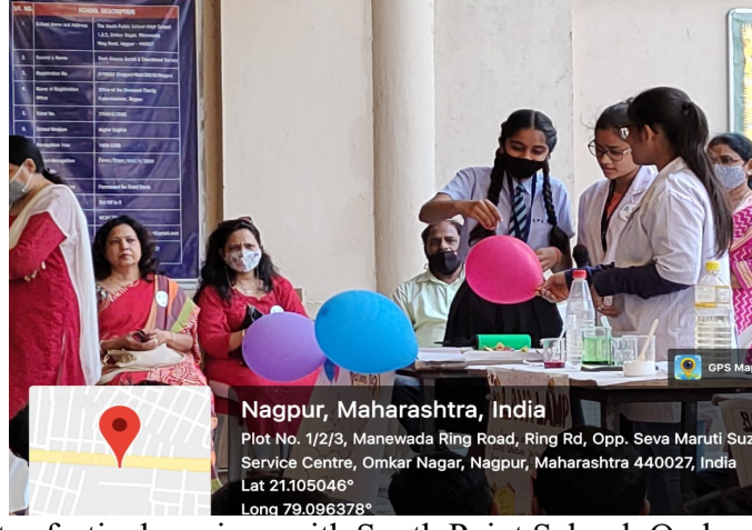
Chapter member delivering offline ACS chemistry festival sessions with South Point School, Omkar Nagar, Nagpur.